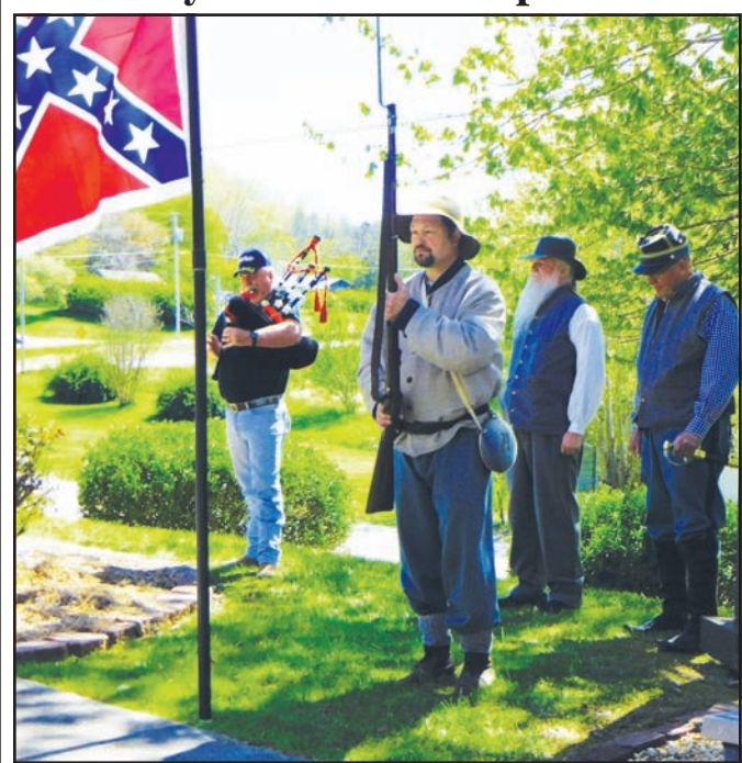
Confederate Memorial Day ceremony